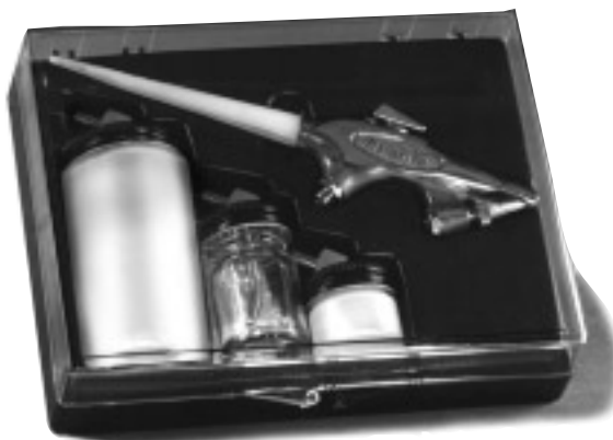
Wren Set Model No. 59-10006